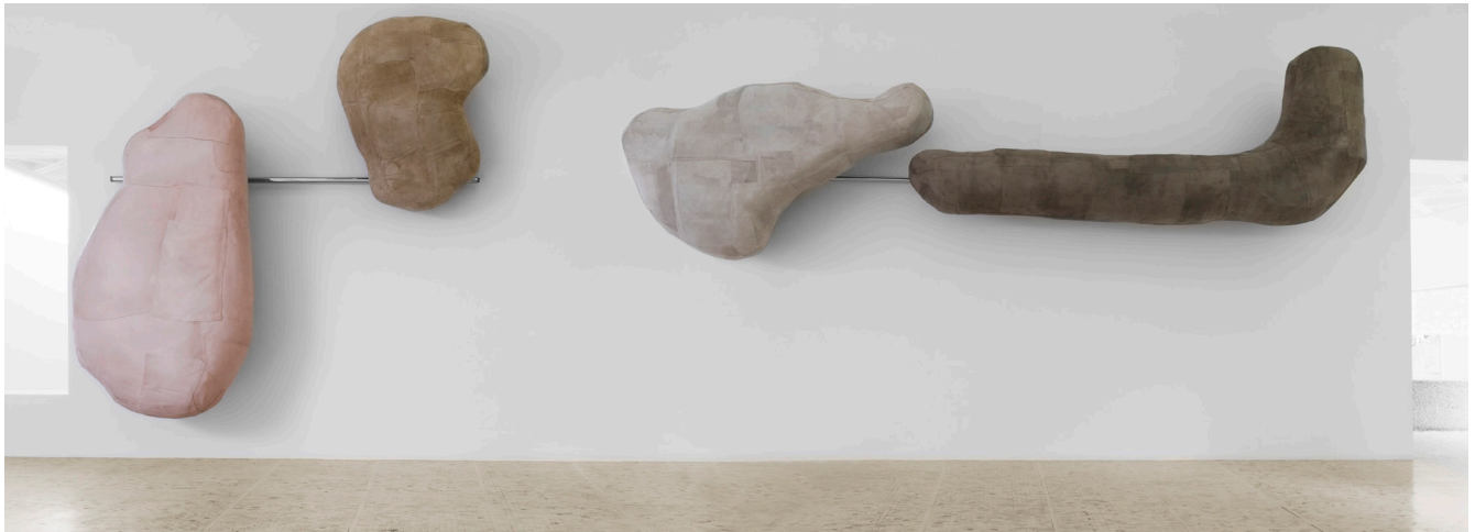
Chin up, 2015