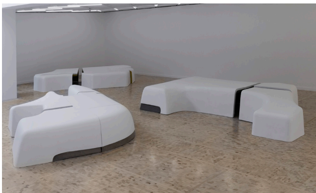
Second Choices (Sample B), (Sample C), (Sample D), 2015