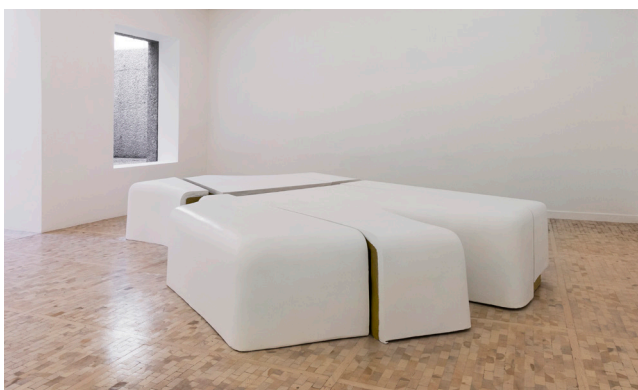
Second Choices (Sample B), 2015